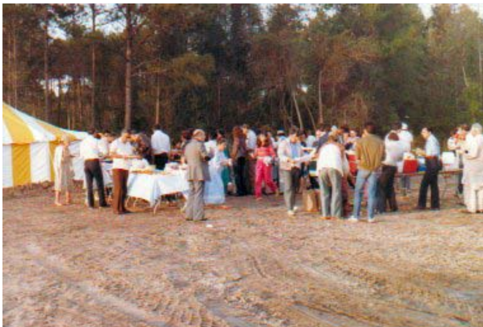
ICNEF's Groundbreaking Ceremony (circa 1983/84)