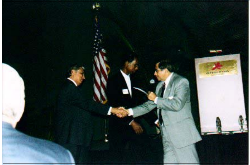
Along with the awards, special plaques were awarded to various individuals for their efforts in helping to make the Islamic Center a reality